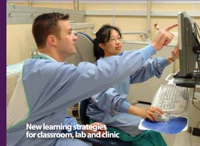
New learning strategies for classroom, lab and clinic